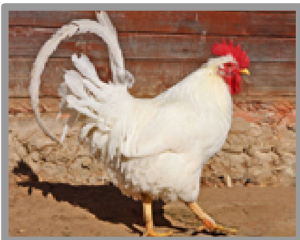
Chicken _ _ _ _ _