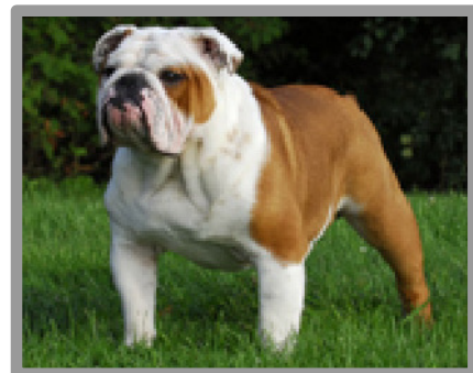
Dog _ _ _ _ _