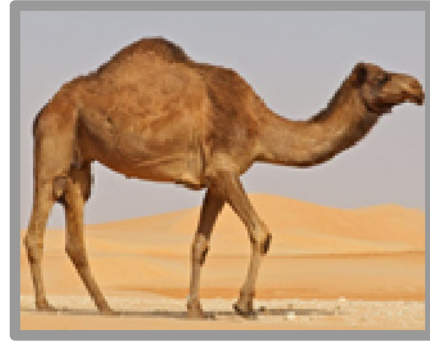
Camel _ _ _ _ _