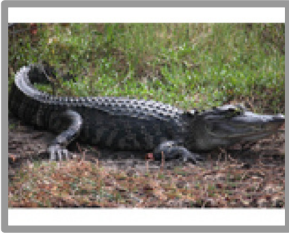
Alligator _ _ _ _ _

Fill in the blanks and complete the names of the animals.