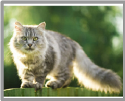
Cat _ _ _ _ _