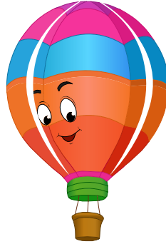
Hot air balloon