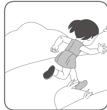
She ran away.