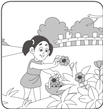
She was collecting flowers.