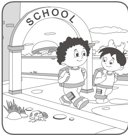
Jack is coming back home.