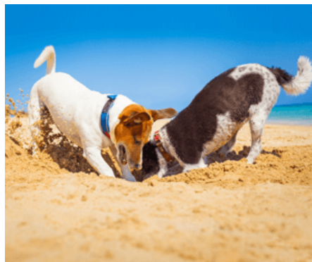
Burying a bone