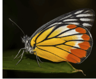
Monarch butterfly (The model)