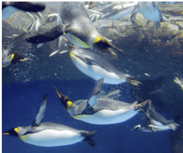
Penguins swimming and feeding in groups