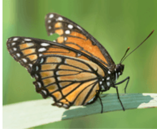
Viceroy butterfly (The mimic)

5. When an animal blends into its environment, it is called _____.