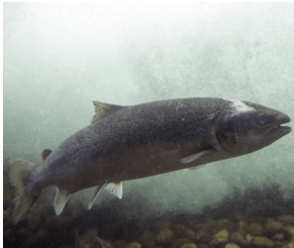
Salmon traveling from the river to the ocean

1. Which of the following is an example of a life cycle adaptation?