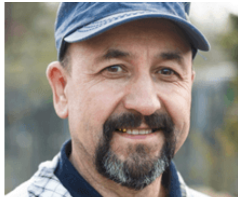
Both frog and human being