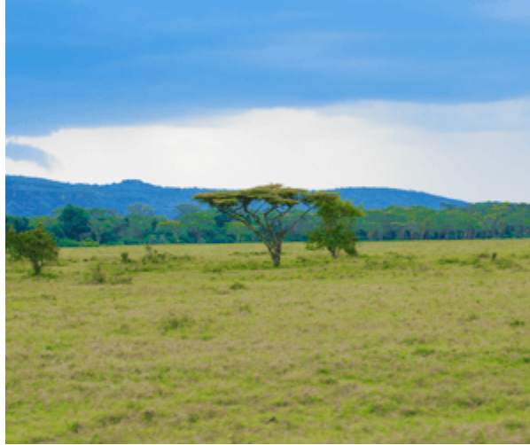
Grasslands with some trees