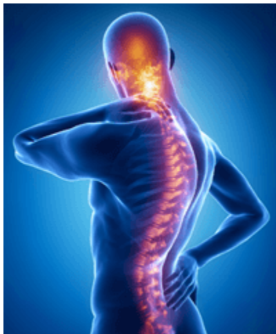
Along the backbone