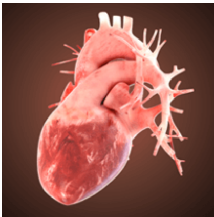
In the heart

13. Which of the following minerals do bones need to remain strong and healthy?