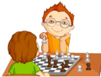
Children playing in a playground

15. Which energy is used when a solid melts into a liquid?