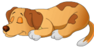
A dog sleeping

14. Which of these images shows energy used for motion?