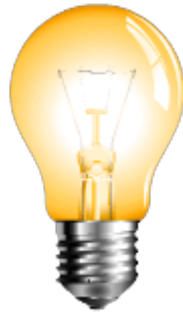
A bulb glowing

10. Which of the following is an example of sound energy?